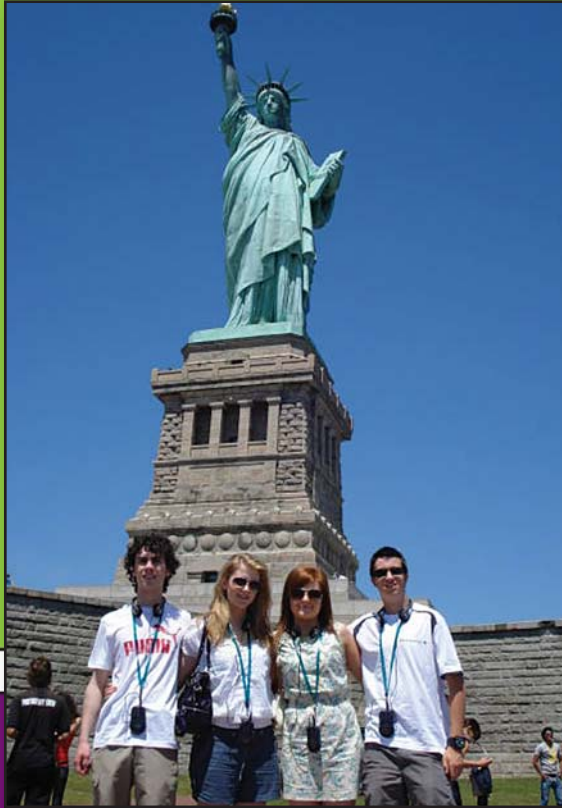
2008/09 ifs Student Investor winners

The competition is played online at www.studentinvestor.org and a national league table allows teams to track their progress against other schools/colleges across the country.